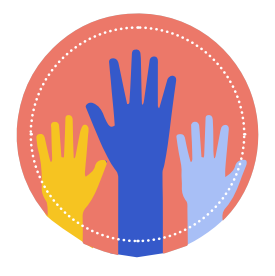
Social and community integration