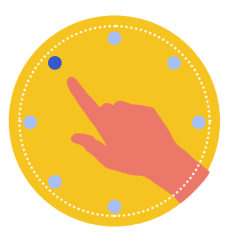
Youth choice and self-determination