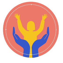
Individualized and client-driven supports